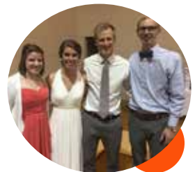
We got to celebrate with dear friends as they became one earlier this month!