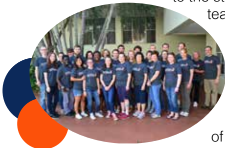
NLGM and Global Year Teams Together.

amazing things through the students we worked with and our team from North America.